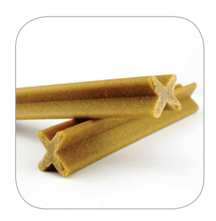
Dental Sticks / Specialty