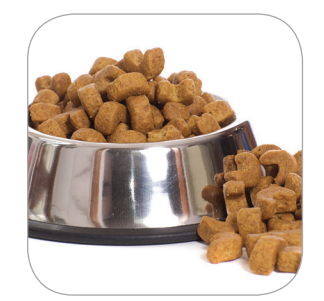
Dry Food / Kibble